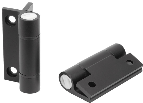
Hinges with closing spring